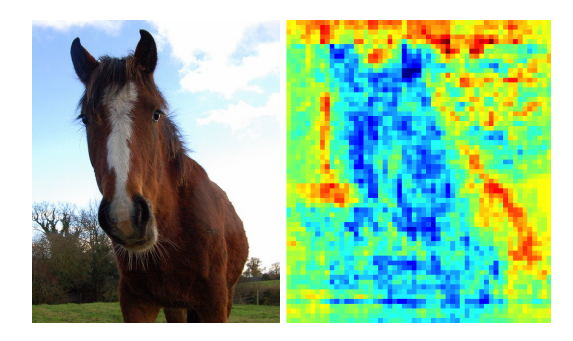
Fig. 2 . Original image (left) and response map (one scale) for sky classifier (right). For this kind of texture classifier, sumpooling is more appropriate than max-pooling. See Text.

seems to be appropriate for object detectors because we want detect the presence (or the absence) of an object in an image. However, applying the same strategy for region classifiers characterized by texture is more questionable. Indeed, texture features are intrinsically lower-level than object detector, so that false positives are supposed to occur more frequently. This is illustrated in Figure 2. Although the sky detector shown in Figure 2b) fits sky areas pretty well, there are some outliers, e.g. high values appear in the grass area.